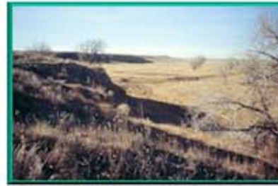
Sand Creek Massacre National Historic Site Opens!

The Santa Fe Trail was first recognized as a National Historic Trail in 1987, in 1992 became a Colorado State Scenic Byway and in 1998 it became a National Scenic Historic Byway. This "Trail of Commerce" served as a trade route between Missouri and the Mexican frontiers from 1821 to 1880. Heritage travelers visit today to discover the magic of its history and retrace authentic steps taken by merchants and traders on the way to Santa Fe. Learn more about CPI's program, visit http://coloradopreservation.org/